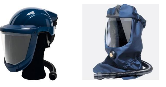
Respiratory protective hood (+ protective suit)