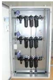
Clean Air installed