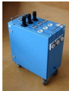
Air Jet mobile