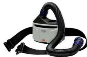
Filter blower device