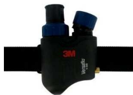
Air connector device