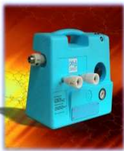
Air Boy portable