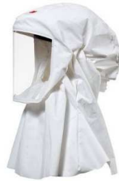
Respiratory protective helmet or hood + protective suit